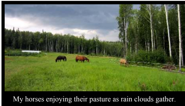
My horses enjoying their pasture as rain clouds gather.