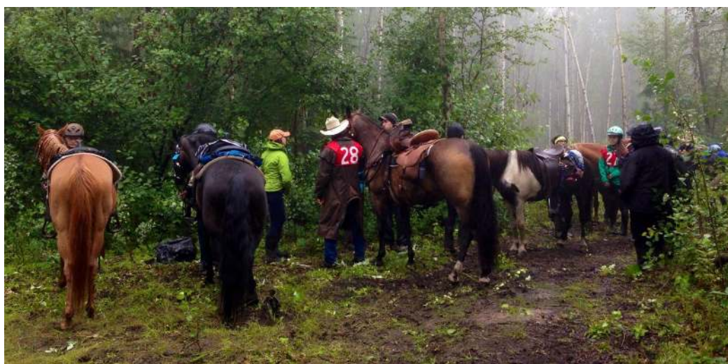
Horses, riders and crew members at a wet, foggy pulse and respiration stop.