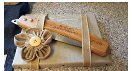
Horsemanship Award, Round Valley 2015.