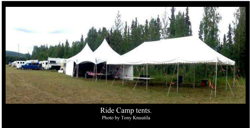
Ride Camp tents.

Late Friday afternoon, the wind came up. The clouds were hanging low like grey billowed sheets folded in upon each other. Rain was on the way. Good for the forest fires still burning, but pressing for us to get the white circus-type tents up at once. They were huge, cumbersome, heavy and not easy to put up. Enter Beth. Beth